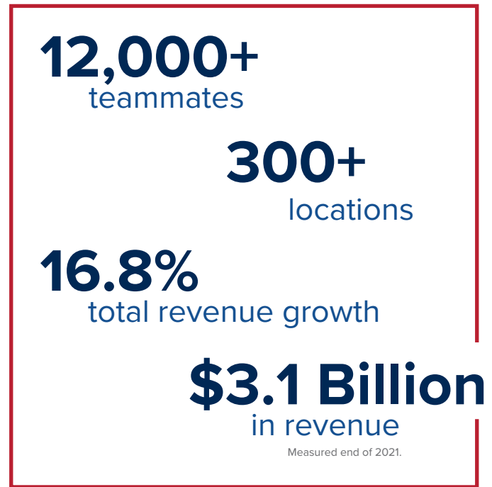
2021 Highlights Across the Business